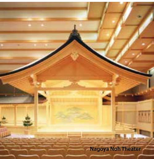
Nagoya Noh Theater

Located in the heart of Japan, Aichi, with its capital Nagoya, has seen over the years several industries flourishing, as well as art and culture. It is also blessed with some beautiful nature. Aichi and Nagoya are where new ideas are born everyday, thanks to its strengths both in academia and industry.