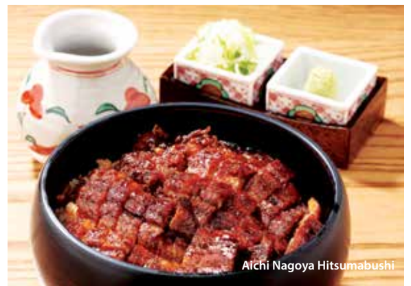
Aichi Nagoya Hitsumabushi