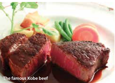
The famous Kobe beef