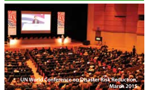
UN World Conference on Disaster Risk Reduction, March 2015