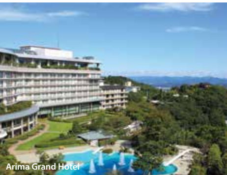
Arima Grand Hotel