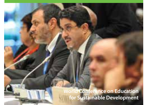
World Conference on Education for Sustainable Development

Under the banner of “Learning Today for a Sustainable Future”, the Conference celebrated the achievements of the Decade, identified lessons learnt while setting the stage for the future of ESD. It also highlighted the role of ESD for the transition to green economies and societies and as a catalyst for cross-sector planning and implementation of programmes in areas such as climate change, biodiversity and disaster risk reduction.